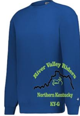
BA ROYAL - Logo on the Back Full Size