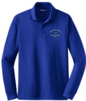
Sport-Tek Long Sleeve Micropique Sport-Wick Polo