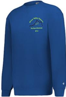
Athletic Fleece Pocket Crew—Logo on Front $42.00

New & Ready to Order —River Valley Riders—KyG Sweatshirts! Please note that the 2X are $4.00 more. NOTE: The crew sweatshirt logo is not showing correctly, but will be on the back. I am also trying to get a Hoodless Hoody sweatshirt.