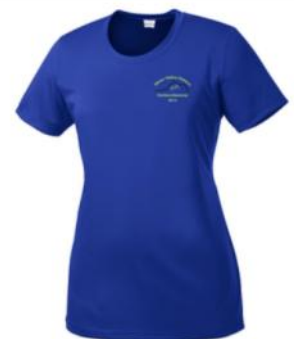
Sport-Tek Ladies Posicharge Competitor Tee