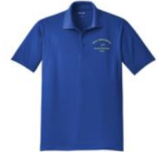
Sport-Tek Tall Micropique Sport-Wick Polo