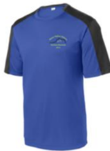
Sport-Tek Posicharge Competitor Sleeve-Blocked Tee