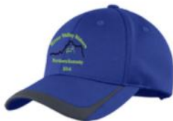
Sport-Tek Pique Colorblock Cap