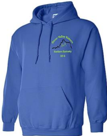
Hooded Sweatshirt—Logo on Front $35.00