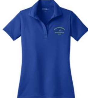
Sport-Tek Ladies Micropique Sport-Wick Polo