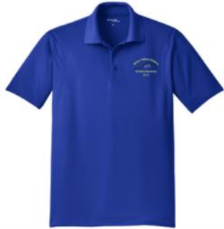
Sport-Tek Micropique Sport-Wick Polo

Welcome to the River Valley Riders Gear Store. Looking for a new shirt or a hat, all you have to do is click on the Store link and order your gear.