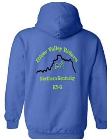
Hooded Sweatshirt—Logo on Back $32.00