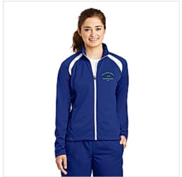
Sport-Tek Ladies Tricot Track Jacket