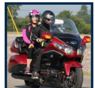
Steve & Lesley Holder RVR Ride Coordinators

Please be aware that many restaurants no longer accept reservations since COVID. To mitigate this, we do try to arrange arrival times to be either before or after their usual "busy times". Our ride sheets note the estimated arrival time, so you can plan your breakfast, snacks etc., to work with the lunch rides.