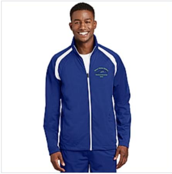
Sport-Tek Tricot Track Jacket