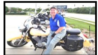
Membership Enhancement Coordinator