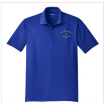
Sport-Tek Micropique Sport-Wick Polo