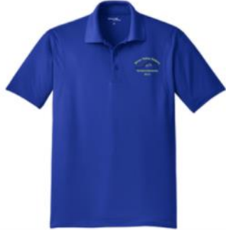
Sport-Tek Micropique Sport-Wick Polo