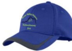
Sport-Tek Pique Colorblock Cap